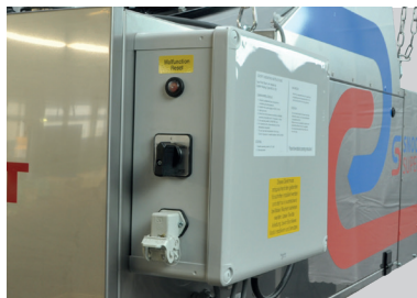
Electronic parts in plastic housing