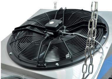
Robust A-class German quality fan