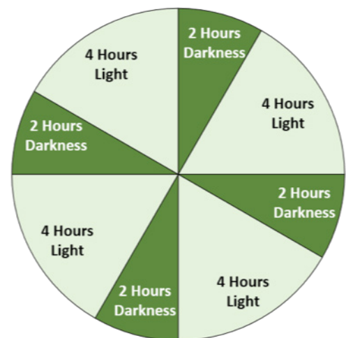
Figure 1.1: Example of an Intermittent Lighting Program

In commercial settings, the positive welfare outcomes associated with brooding by hens can be achieved by providing simulated brooding cycles of light and dark periods, and/or by providing dark brooders, which are warm, dark, and enclosed areas that may simulate the effects of a brooding hen (2). Dark brooders have been found to have long-term preventative effects on feather pecking and cannibalism, and can improve behavioural synchrony between birds, reduce disturbances during resting, and result in calmer birds (3).