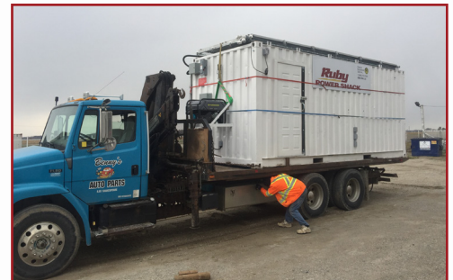
Delivered right to your door